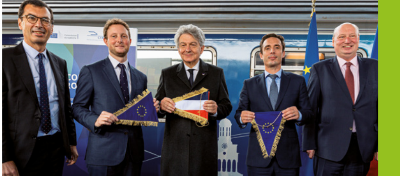
Paris, 7 October

On 7 October, after crossing 26 countries in 36 days, the Connecting Europe Express arrived at its destination in Paris!