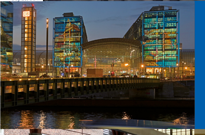
Berlin, 30 September

The next EU conference along the route of the Connecting Europe Express was in Berlin on 30 September. Stakeholders gathered to discuss building up a network of long distance passengers services.